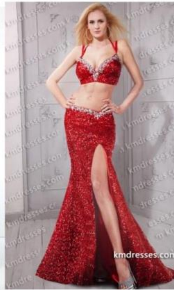
Midriff too revealing and opening by leg to high