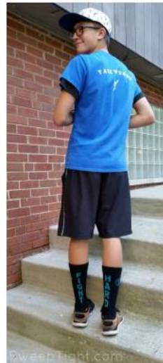
Shorts, t-shirt, ball cap