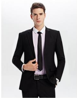
Shirt and Tie, Dress pants