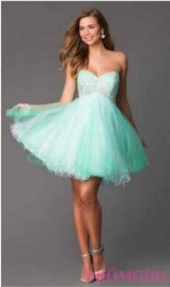
Modest shorter length