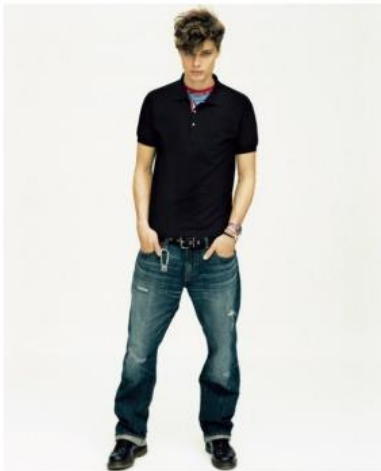
Jeans, no tie