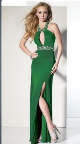
Keyhole too low